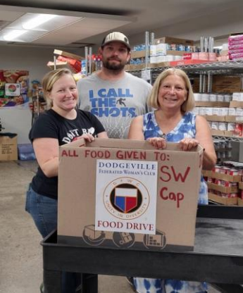
The Dodgeville Federated Woman's Club organized a food drive on September 30th to support the End Hunger in the U.S.A campaign.