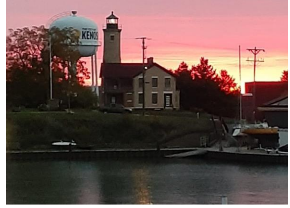
The 1866 Kenosha Southport Lighthouse was illuminated to welcome our GFWC-WI sisters to Kenosha October 20 & 21 for the 64th Junior Fall Conference.