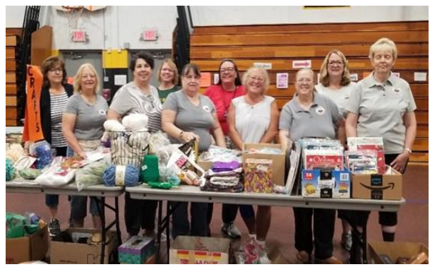
Brown Deer Junior's had a successful Fall Rummage Sale, which helped us raise funds for our annual contributions. We also donated unsold items to several organizations. This year's sale included a Food Drive, in conjunction with the GFWC National Day of Service project. We have decided to continue this initiative for each of our future spring and fall rummage sales.