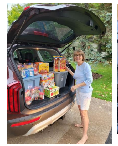
On the National Day of Service, the Stevens Point Woman's Club collected food for the elementary school's backpack program.