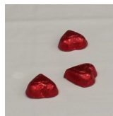
We wove paper Danish Heart baskets and they were filled with an uplifting message and a bite of chocolate!