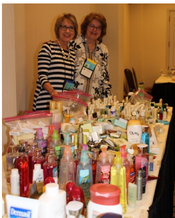
A few fun pics from State Convention in May