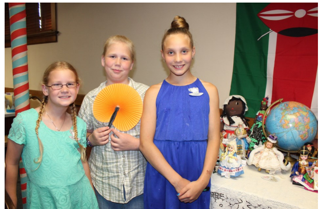
The annual Summer Children's Tea for 8-12 year olds was held at the Rhinelander District Library in June. It's a wonderful partnership with our club and the Library.

The event was held June 26 th and this year's theme was "Around the World". A book is read, lesson on the history of tea around the world and small rocks were painted to take home. A highlight was clubwomen shared their family cookie recipes and the cookies with the children! Lots of preparation goes into the day. The annual Tea at the Library has been a summer favorite for close to 17 years!