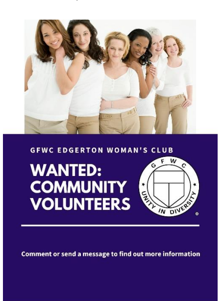
GFWC-WI (November 27, 2022) Boosted for $20

Do you (or someone you know) live in the Edgerton, Janesville, Milton area and would love to get involved in the community? GFWC Edgerton Woman' Club is looking to grow their membership.